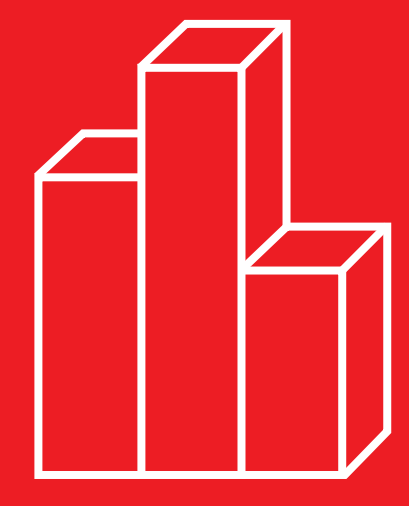
BUILD RESPONSIBLE & SUSTAINABLE COMMUNITIES

The ability of our business to create social and environmental change is a privilege. We make conscious choices to leverage the power of our employees, brands, customers and partners to support positive long-term changes that expand awareness and empower people in our communities to take action.